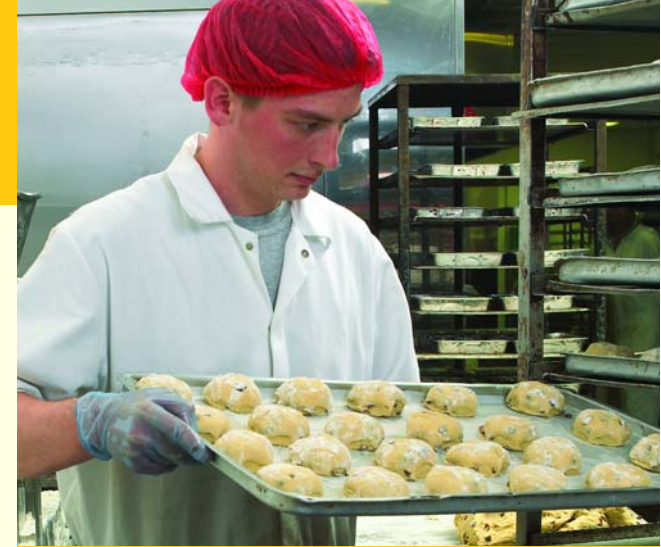
scones on their way to the oven

Every cake that we make is crafted by a skilled baker and finisher. We have learnt that this is the only way that our cakes will look and taste homemade. That's why we are called The Handmade Cake Company and that's why we're proud to present our cakes to you.