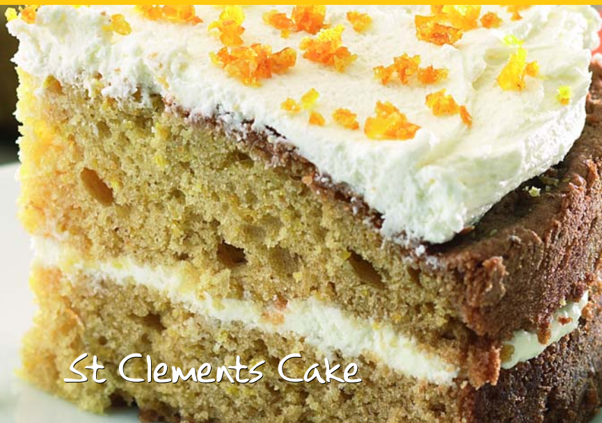
St Clements Cake