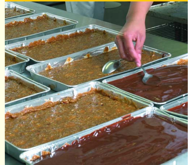
covering maple and pecan in chocolate