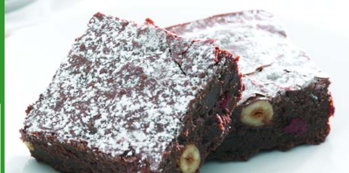
Hazelnut and Redcurrant Fairtrade Brownie